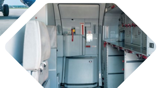
Avonic / Flight Deck