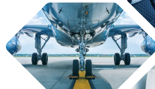
Wheels and Brakes