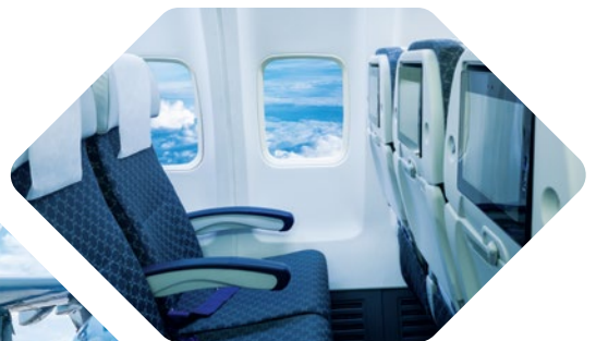
Interior / Cabins