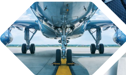
Wheels and Brakes