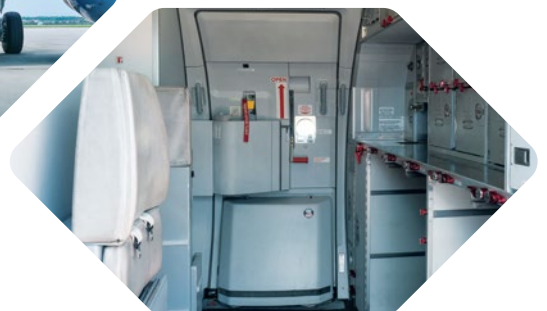
Avionic / Flight Deck